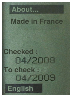
Remind last checking date